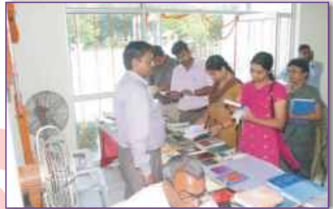
ICPR Fellows buying ICPR Publications