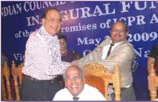
Inaugural Function of Academic Centre and Library, Lucknow