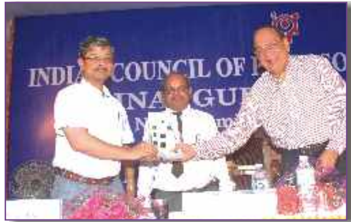
Inaugural Function of Academic Centre and Library, Lucknow