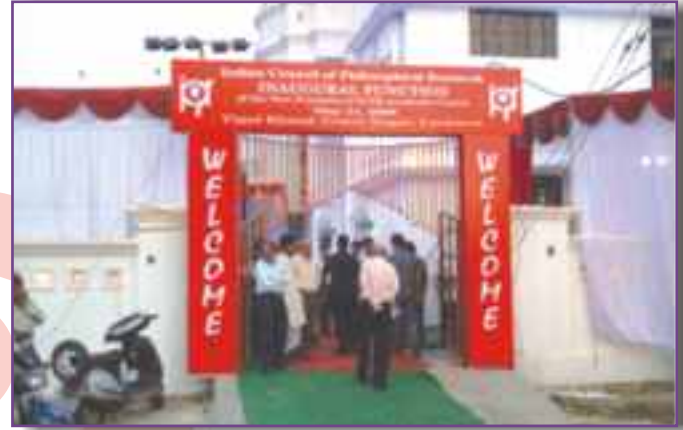
Inaugural Function of Academic Centre and Library, Lucknow

An inaugural function of its new building was held on May 21, 2009. The function was followed by colloquium of the Fellows of the Council. The Council