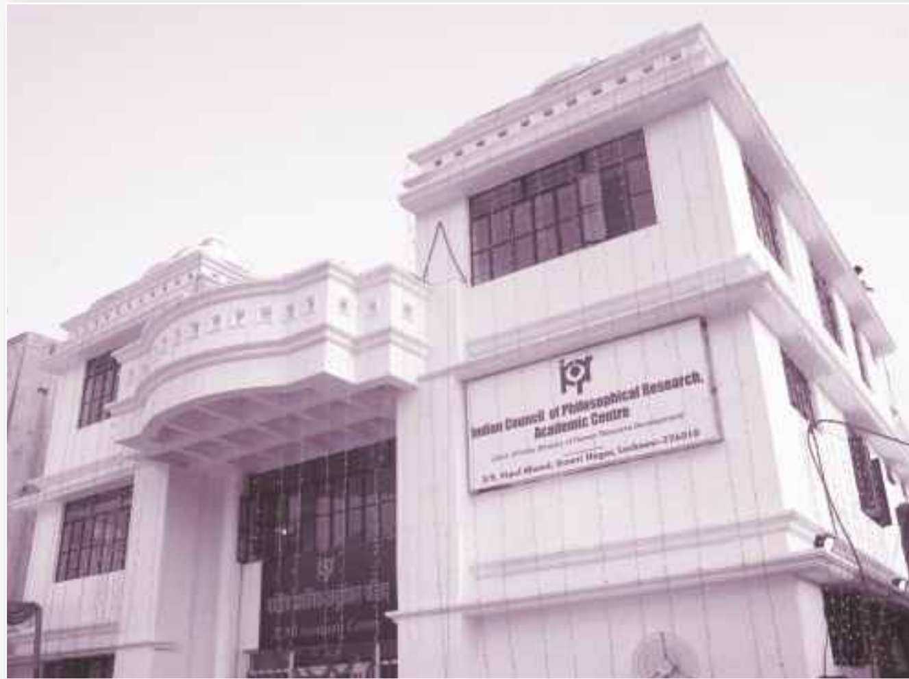
Indian Council of Philosophical Research, Academic Centre, Lucknow