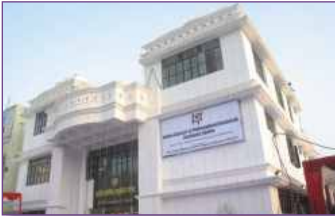
Academic Centre and Library, Lucknow