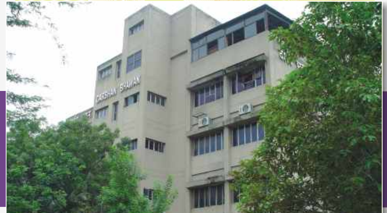
Indian Council of Philosophical Research Darshan Bhawan 36 Tughlakabad Institutional Area New Delhi - 110062