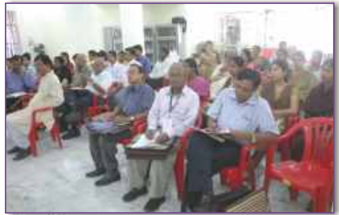
Fellows participating in the Fellows Meet