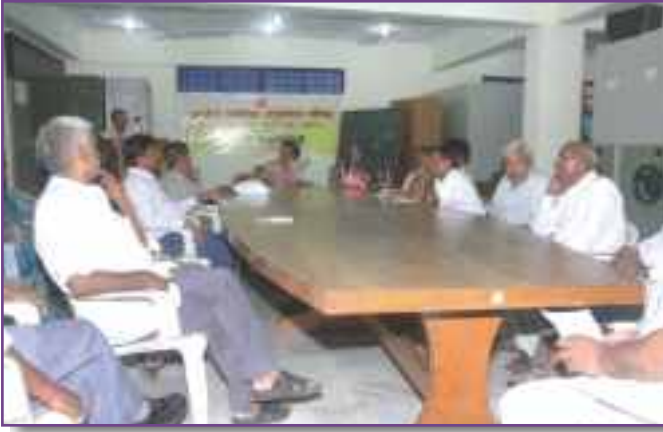
Hindi Pakhwara programme at Academic Centre, Lucknow