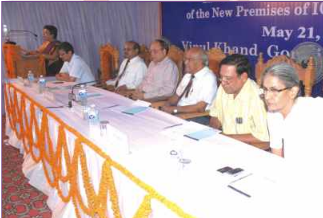
Inaugural Function of Academic Centre and Library at Vipul Khand, Gomti Nagar, Lucknow

Inaugural Function of the ICPR Academic Centre and Library was held at Vipul Khand, Gomti Nagar, Lucknow. It was followed by a colloquium of the Fellows of the Council.